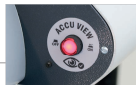
Accu View precision cutting system