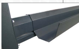
Collecting tray for prints (optional)