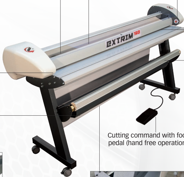
Cutting command with foot pedal (hand free operation)