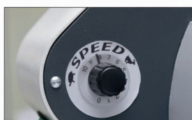
Adjustable cutting speed regulator (max. 100 m/min.)