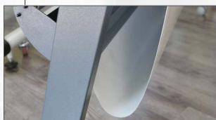
Waste catcher to keep the working area clean and neat