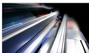
LED illuminated cutting line for a precise media positioning