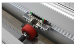
Self-sharpening circular blade for a long term reliability and no service costs