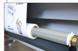
Unwinding front shaft to cut from roll to sheet (optional)

Manufactured in compliance with CE regulations