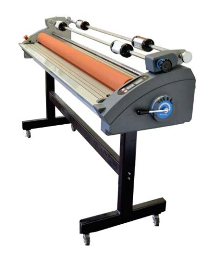
Included 3" Auto-Grips