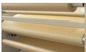
High quality felt belt with automatic tracking

Automatic pre-heating timer (to set the required time)